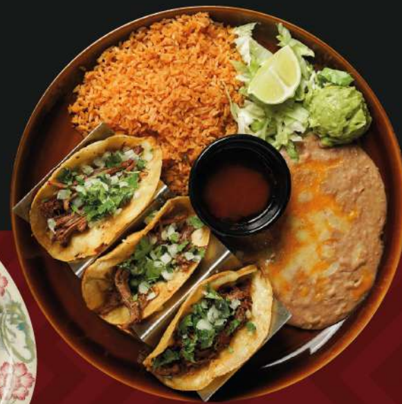
TACOS DE BIRRIA